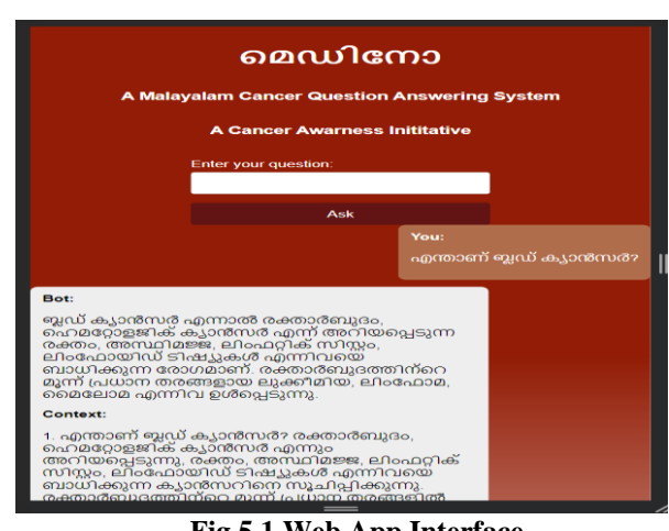
Fig 5.1 Web App Interface

• Power Consumption: 320W, Interface: PCIe 4.0 x16